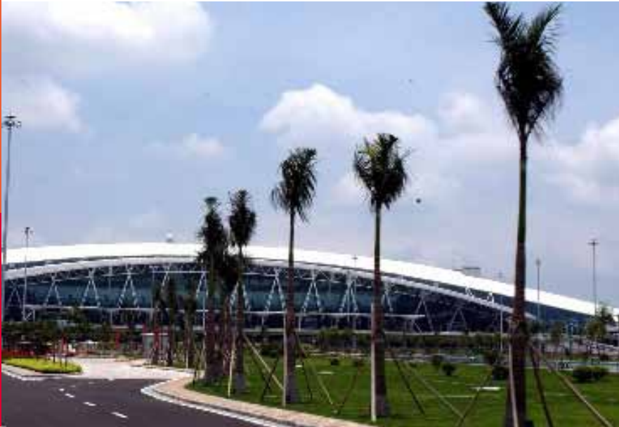
Air Cargo Center