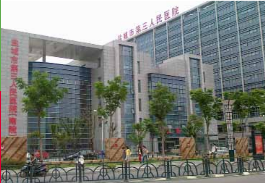
Yancheng No. 3 People's Hospital