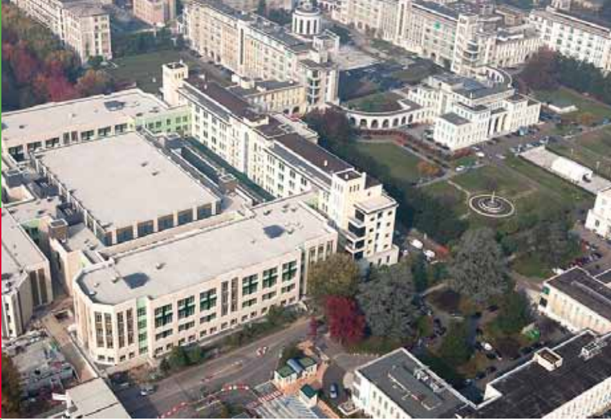
Niguarda Ca'Granda Hospital